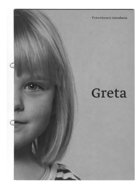
figure II [a+b]